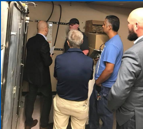
ABB Finland Representatives Visit KCKCC Campus

Global vice presidents from ABB Finland were on the KCKCC campus Sept. 25 touring the installed VFD drives the company recently donated to the college.