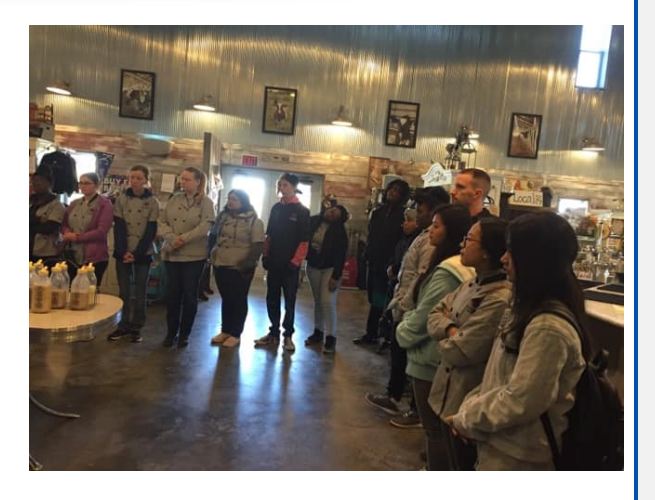
KCKCC culinary arts students took a field trip Nov. 1 to the Shatto Dairy to see how a dairy farm is run. Students also tried a variety of flavored milks and tasted different types of cheeses and butters.

Students in the Physical Therapist Assistant Program spent some time in class this week learning how to wrap wounds. Looks like they were having some fun learning!!