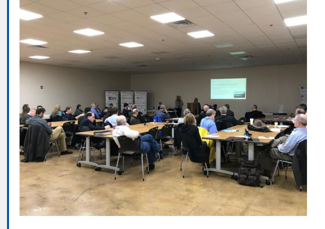
KCKCC-TEC was pleased to host the KCK Chamber of Commerce's Storm Water Community forum this morning!