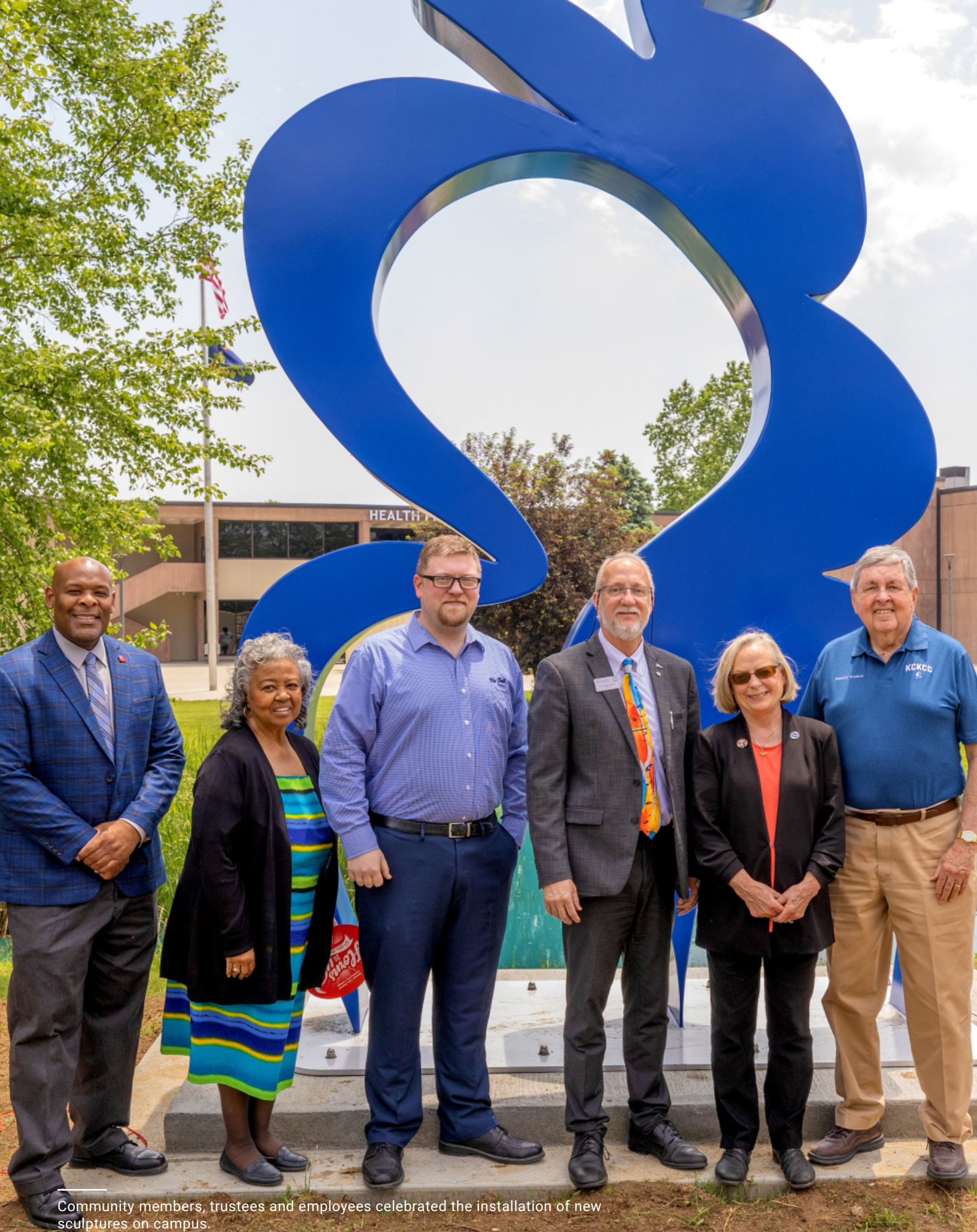
Community members, trustees and employees celebrated the installation of new sculptures on campus.