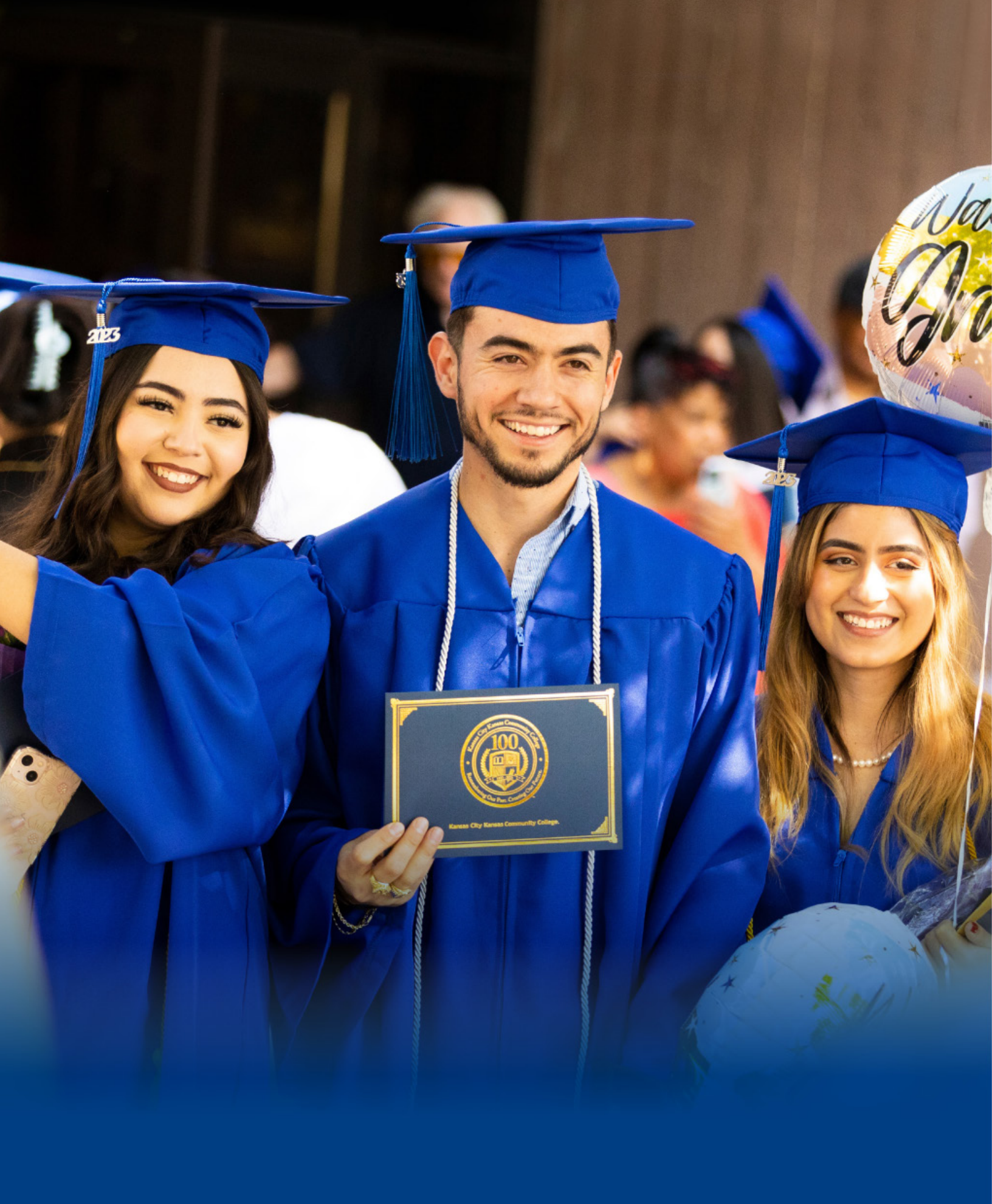
KCKCC graduates celebrated after the 2023 Commencement.