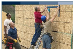
Priority 4 - Community Engagement