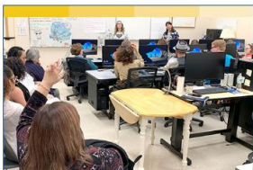
Priority 3 - Employee Engagement