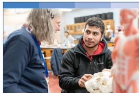
Priority 2 - Quality Programs & Services