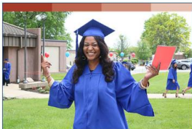
Priority 1 - Student Success